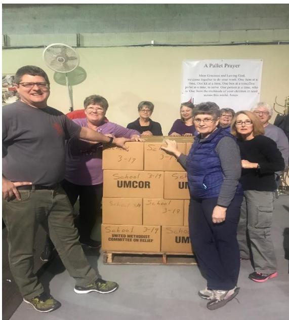
This is a picture of most of those who went to UMCOR West Depot last year.

If you are interested please talk to Tereica Kaumheimer or Tressa Cummings